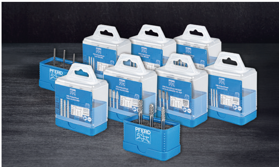
Image 1 Seven new sets with best-selling assortments – now available from PFERD

Number of characters 0 (including spaces)